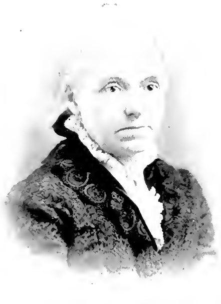
REBECCA LATIMER FELTON.

his private secretary and general counselor. She intuitively comprehended his duties to his constituents and became so prompt and skillful in his work that it was hard to tell where her work ended and his began. His fame as a debater and student of public questions became national, and yet every printed speech passed through her hands, and his super-excellence as an orator and collector of statistical facts perhaps was largely due to her discriminating mind and thorough revision, as well as her inspiring sympathy and enthusiastic loyalty to his interests. During six years of Congressional life and six years in the State legislature her hand was on the helm of his political barque, and he took no important step without her aid and counsel. She traveled with him during campaigns and talked to the people in private, while he addressed them in public. Yet with all these efforts Mrs. Felton is an enthusiastic farmer and a regular contributor to farm journals. She keeps up the duties of a house-